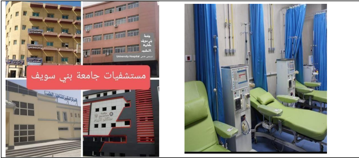
1. Beni-Suef University Hospitals

Health care services facilities for students, academics and administrative staffs' wellbeing