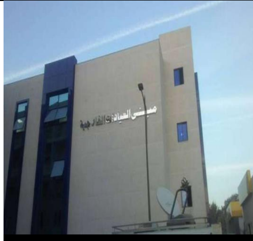
4. Building of outpatients clinics